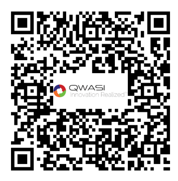
scan to learn more

Upgrade corporate events with smart contactless gamified experiences. Leverage QWASI to enable both desktop and mobile responsive programs with real time participation, gamified feedback to enhance learning engagement, knowledge retention, and increase positive sentiment around corporate learning.